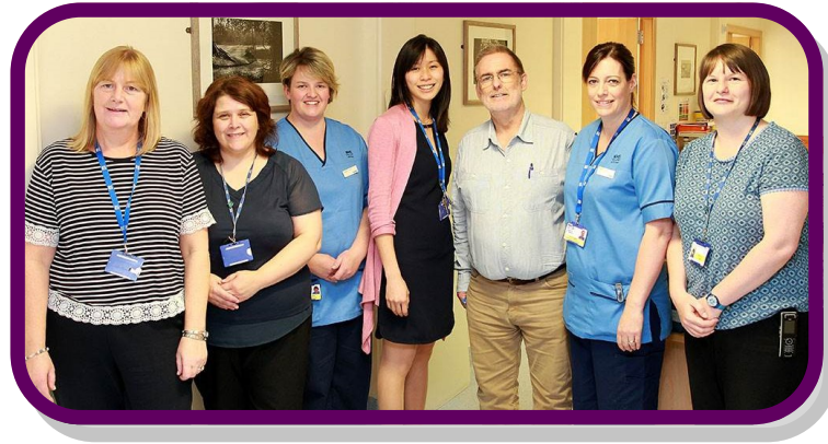
Scotland NHS Dumfries and Galloway