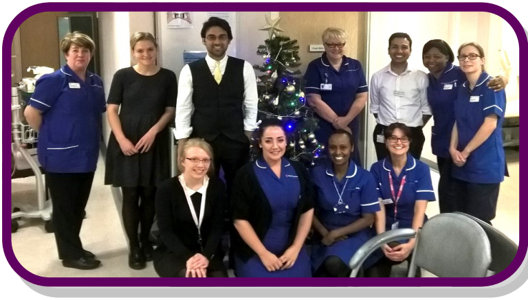
England Barnet & Chase Farm

* based on 2015's and 2016's recruitment numbers per centre