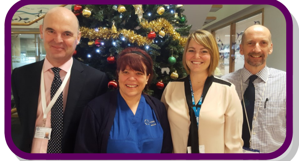
Wales Betsi Cadwaladr University Health Board (Ysbyty Gwynedd)